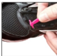
Line Up Lace Tip With Eyelet Hole From The Outside