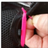
Turn Textured Side Up and Pull Across Shoe and Repeat Process On The Opposite Side Inserting From The Outside