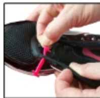
Pull Tip Through Eyelet