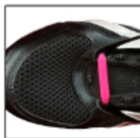
Finished First Lace, Now Repeat