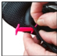
Insert The Tip Into The Eyelet Hole